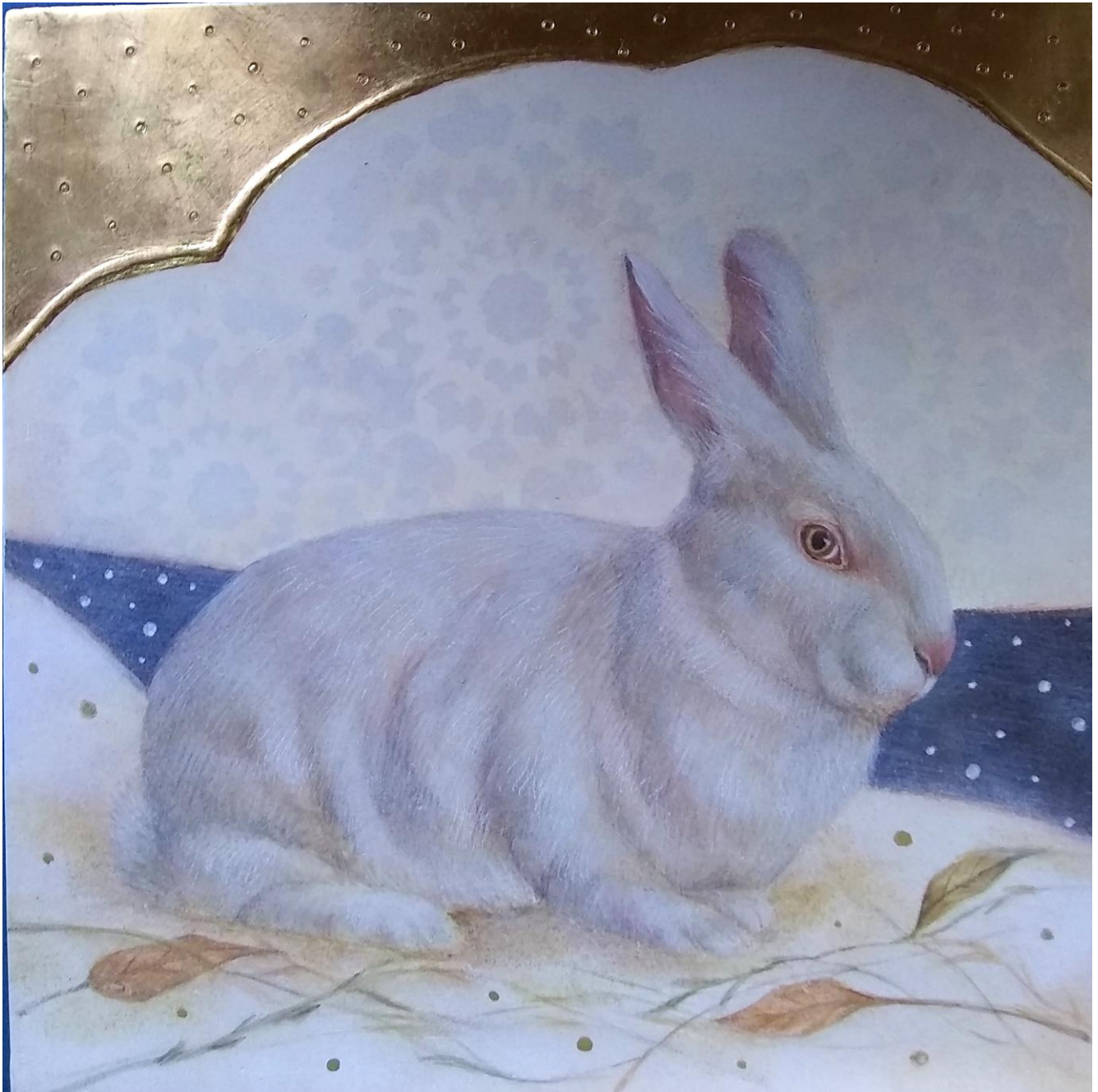
"A Rabbit in Winter," egg tempera and gold leaf, 8" x 8"

The hardest thing has been to not be able to teach my students in person. I miss the interaction, but I have learned Zoom technology through my part-time position at Westfield State University. I have been giving a few lessons to young students this way, but find that virtual teaching takes a lot more preparation and time.